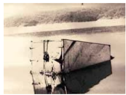
Freezer truck that surfaced from the depths of the Danube, April 1999 (Free Serbia, 2001)

Oskar Kliper's family did not have especially deep roots in Serbia. His Eastern European Ashkenazic ancestors had originated from Wiznitz, in present day Ukraine. Sometime during the late 19th century they managed to escape the relentless plague of anti-Semitic, Czarist-era pogroms and persecution. While a part of the family found temporary refuge in what was then considered highly civilized Germany, Oskar's paternal great grandparents made their way to the Bosnian capital of Sarajevo, with its long established reputation of welcoming persecuted Jews since at least the bad old days of the Spanish Inquisition.