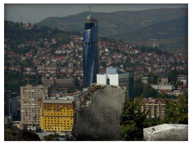
Serb snipers camped in the cemetery during the Siege of Sarajevo in the early '90s. Most of the tombstones still carry the scars.

I remember a conversation he had with a Serbian man who ran away from Sarajevo. The man spouted the Serb nationalist party line - how Republika Srpska (the notorious breakaway regime largely funded and organized from Serbia) was 'defending' his people around Sarajevo. My father responded that maybe that man did not know everything - that Sarajevo looked more like a "city under siege... and why were Serbian forces using the heights of the old Jewish cemetery as the vantage point for artillery fire and sniper shooting at the residents of Sarajevo?!" The man remained silent.