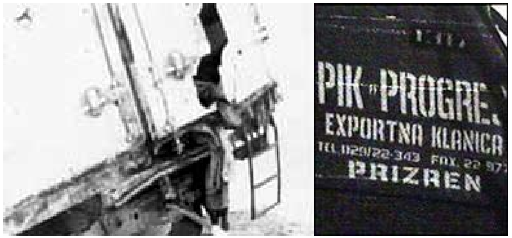
Limbs of murdered Kosovar Albanians, protruding from the back of refrigerator truck: the Kosovo connection ( Free Serbia , 2001)

It was a "Mercedes" truck with a green cabin and a white freezer. On the side of the truck it had markings that said it was the property of a meat processing firm from Pec, in Kosovo, with the phone number 029-72997.