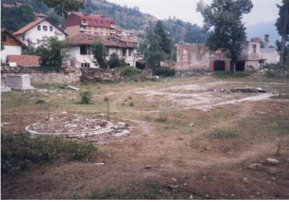
RESİM 11. Bosnia-Herzegovina. Foča – Site of the destroyed Aladža Mosque (1996). Bosna-Hersek. Foça – Yerle bir edilen Alaca Cami'nin yeri (1996).