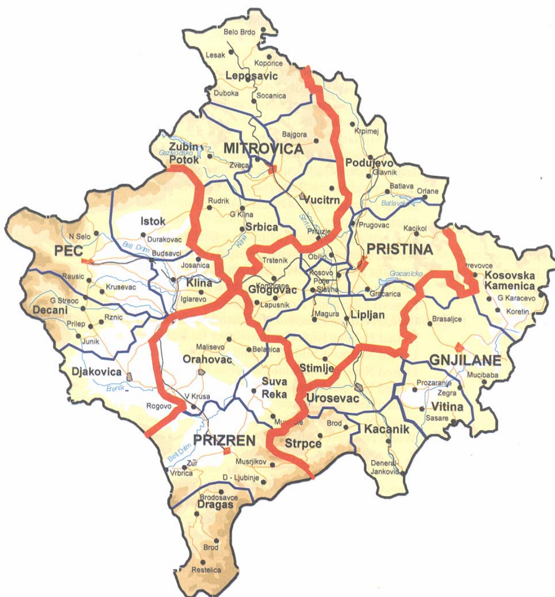
Figure 4. Map of Kosova including districts and municipalities. Place names in Serbian.

In the course of the twelve days of our stay in Kosovo we were able to visit all regions all 5 districts of Kosovo, all major cities and 13 of 29 municipalities, including Leposavic in the major Serb enclave north of Mitrovice. We visited more than 20 libraries and other cultural institutions and had official meetings with UNMIK and 4 other important international organisations. We made professional interviews and had talks with more than 45 persons - and met hundreds of Kosovar library and cultural workers. The information provided in this part of our report is based on our own experiences and supplemented by other sources referred to in the text.